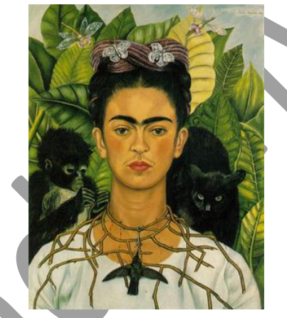
Self Portrait with thorn necklace (1940)