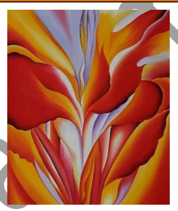
Red Canna (1924)