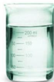
SOLVENT Liquid the solute dissolves in