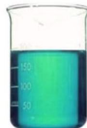
SOLUTION Solute dissolved in solvent