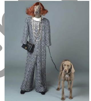
Walker Evans (2017)